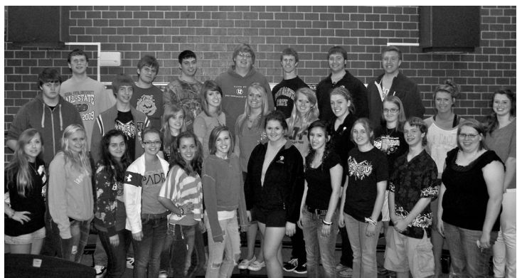
Above: Concert Choir Division I Recipients